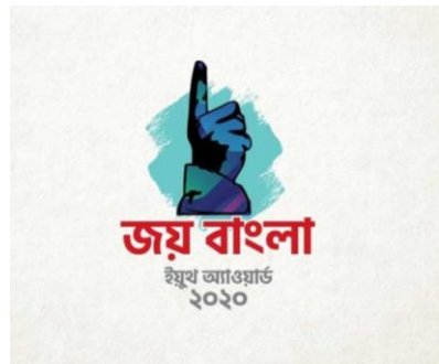
Joy Bangla Youth Award 2020