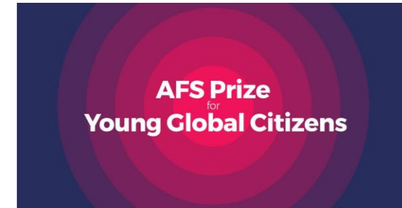
AFS Prize for Young Global Citizens 2020