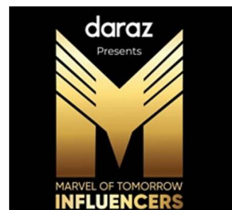
Marvel Influencer Award 2021