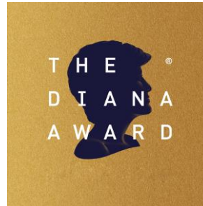
The Diana Award 2020